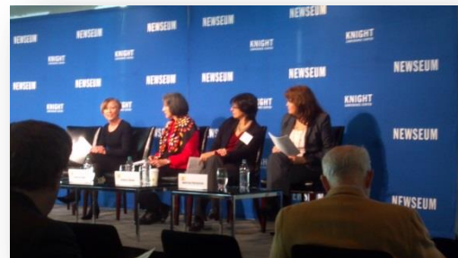
Panelists discuss proactive disclosure at our 2013 Sunshine Week event.

On October 1 st , OTG published its annual Secrecy Report , highlighting the secrecy issues surrounding the National Security Agency's (NSA) surveillance programs, and detailing the stagnation of secrecy indicators. The surveillance revelations cast serious doubt on the accuracy and the meaningfulness of the government's statistics about surveillance under the USA PATRIOT Act. As a special section for this year's Secrecy Report, we presented "5 Big Ideas" to kick-start the kinds of massive changes needed to create noticeable difference